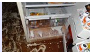
The mud and waste left the house with extensive damage.

The “rip out” stage of the rebuilding effort progressed swiftly in this community of teachers, fire fighters, police, many with the skills to make repairs. Volunteer laborers by the hundreds and donations of tools and supplies came from services organizations from all over the area. St. Margaret Mary provided organization and administrative support coordinating the donations and recycling the tools and supplies. Now, however, the costly rebuilding stage starts and the unsettling realization that insurance covers only a fraction of the basics.