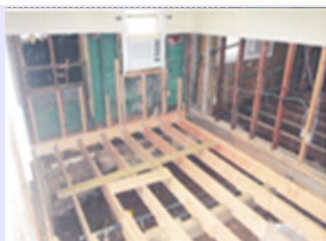
The home after the damaged floors and walls were removed.

The damage to the small homes was extensive. Repairs just to regain occupancy included a new floor, new wallboard and insulation, new doors, as well as systems and appliances. FEMA has given the family $6,500 “for construction costs.” No other assistance is available as their homeowner's insurance covers nothing as the damage is considered flood damage. The Rodriguez story is not uncommon as hundreds of families in Midland Beach are left with limited and inadequate insurance and disaster relief.