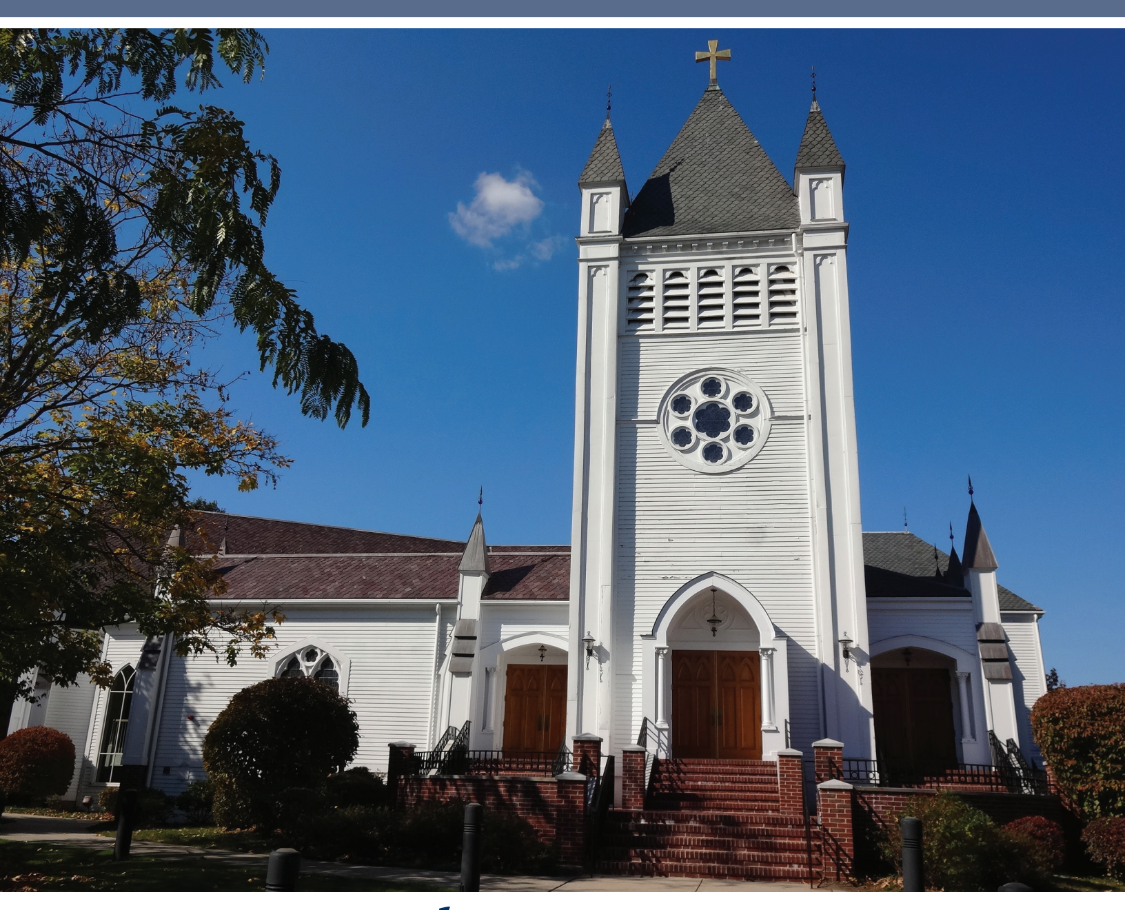
Faith in Our Future